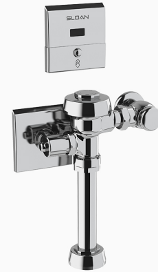
Variations Not Shown: Angle Stop Bumper