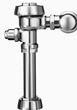
Variation Not Shown: Less Ground Joint