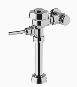
Variation Not Shown: Trap Primer