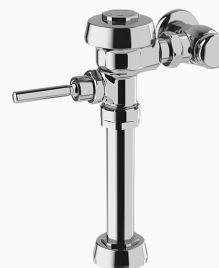
Variation Not Shown: Front of Valve Handle